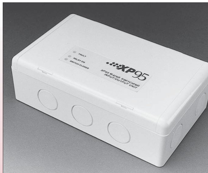
Part no 55000-875

When output bit 0 is set to logic 1 on two or more consecutive pollings, the relay changes state to the "set" condition. Bit 0 must be set to logic 1 as long as it is desired to keep the relay in its set state. The relay will remain latched in the set state until output bit 0 is set to logic 0 on two or more consecutive pollings. Neither the removal of loop power nor the discontinuation of interrogation of its address will affect the state – set or not – of the relay